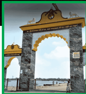
Nari Devi Temple