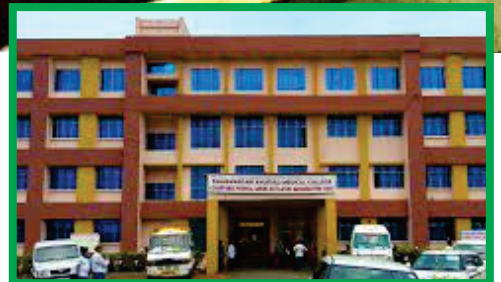
Dhanvantri Ayurved Medical College